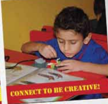
CONNECT TO BE CREATIVE!