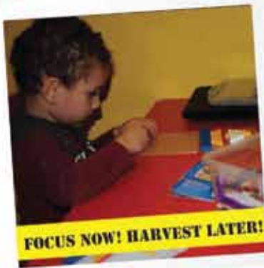
FOCUS NOW! HARVEST LATER!